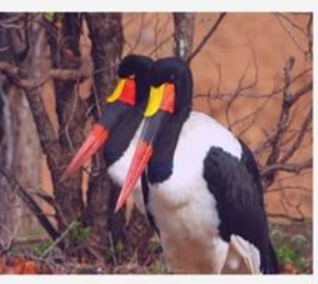
Botswana Namibia Masai Mara / Serengeti South Africa